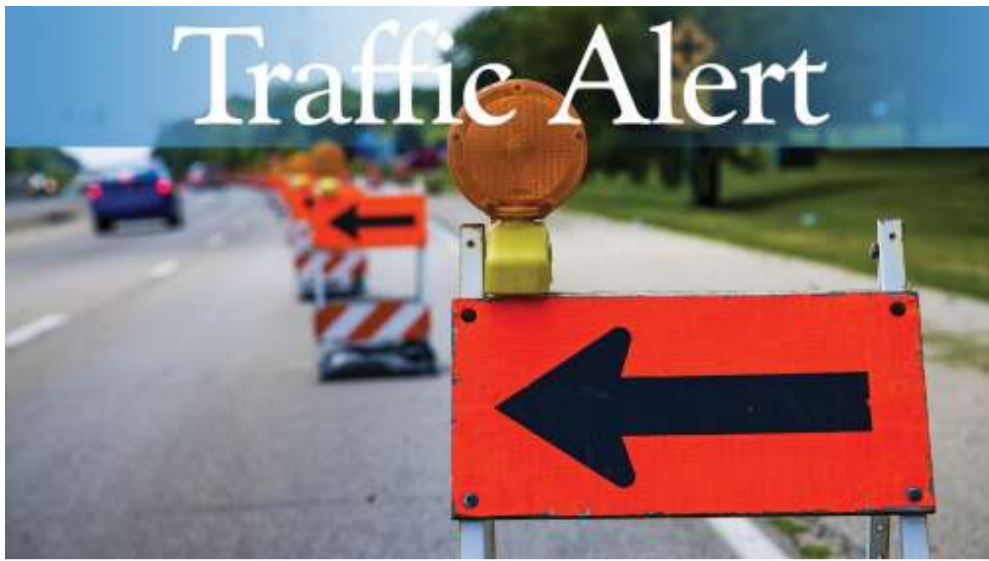
Beale Road closed on account of wires down