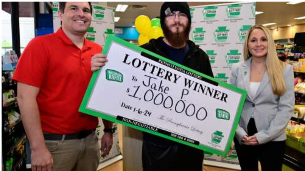
Butler resident wins $1 million from lottery ticket from Sheetz