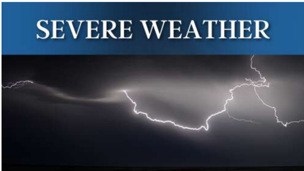
Heavy wind expected Wednesday, potential snow tonight