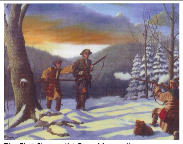
The First Shot, artist Deac Mong, oil on canvas, 2007.